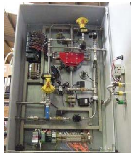
The Millmaster is totally automated

The device itself operates on an iso-kinetic extraction system. For very lean flows it would be possible to illuminate the material in flow, the angling of camera would make the device very unique and not compatible with the vast variety of different pipe networks that occur in industry. If the powder to air mass ratio reduces to around 4:1 the obscuration by the powder in the pipe becomes too great. The iso-kinetic method allows a representative sample to be taken at any point. The MillMaster is designed so that this sample is passed through the system in such a way that no obscuration takes place.